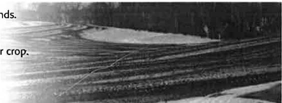
Winter spreading is allowed, but various conditions and restrictions apply.